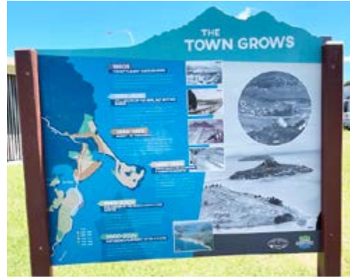
This side of the panel tells how Tairua has grown from its origins in the 1860s.

Illustrated with old photographs, these panels not only provide history about Tairua's 160 years of European settlement, but are a community asset drawing tourists to the site.