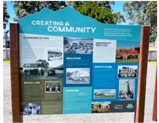
The reverse side of the panel tells how a community was created and enhanced.